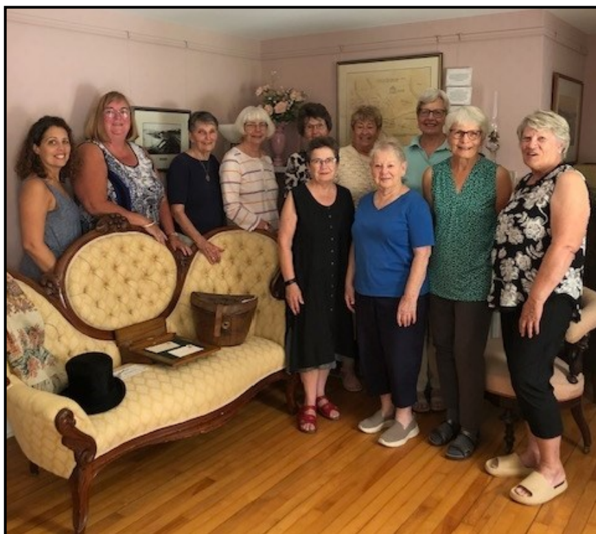
A few of our tea volunteers at a post season wrap up.